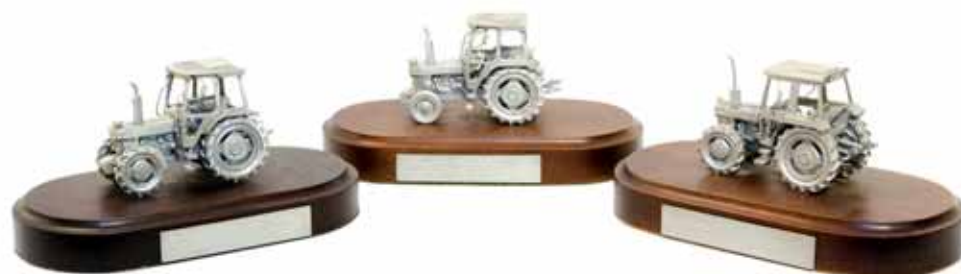
Top left: Piet's models of early Fordson tractors include this unusual Russian-made cardboard model kit of a Fordson F tractor. It was supplied pre-cut and assembled without glue.