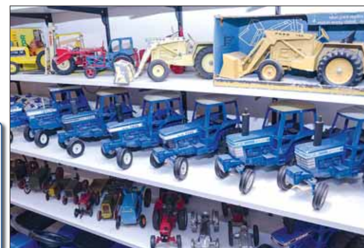
The chunky Ford 8000, 9000 and TW Series toys on the centre shelf were all made by Ertl and date from the 1970s and 80s.