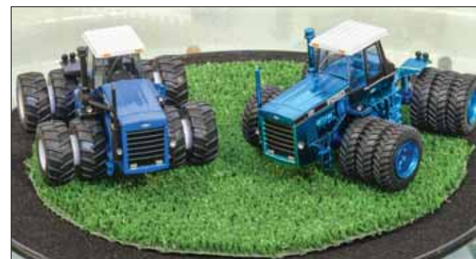
Standard blue, left, and the rarer metallic 1/64-scale Ford 1156 models were made for Toy Tractor Times by Top Shelf Replicas. Piet doesn't have the gold version, but that's only because they often sell for more than $1000.