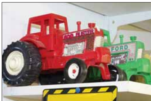
Above: These red and green Ford 8000/9000 tractors were made in the USA by Processed Plastic. Piet is still looking for the blue version to complete his set.