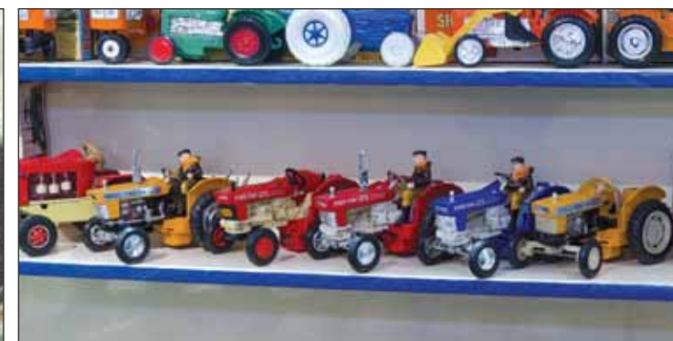
Piet's collection of Ford 5000 tractors includes these plastic copies of Corgi's tractor. The first two in the line-up were made in Germany, while the other three are made by Hoover in Hong Kong.