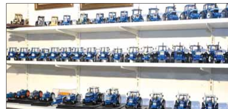
A selection of Piet's more recent Fordson and Ford tractor model releases from Britains, MarGe Models and Universal Hobbies.