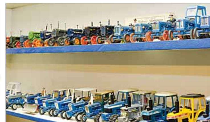
All the popular Fordson and Ford toys and models are represented in the collection, including dozens of 1/32-scale Majors, New Majors, 1000 Series and TW Series tractors.